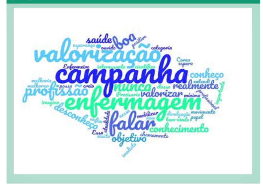
Figure 2: Word cloud visually representing the words most used in the study by the participants